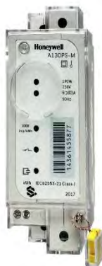
AS130PS-M with M-Bus CIU