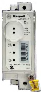
AS130PS-P with PLC CIU